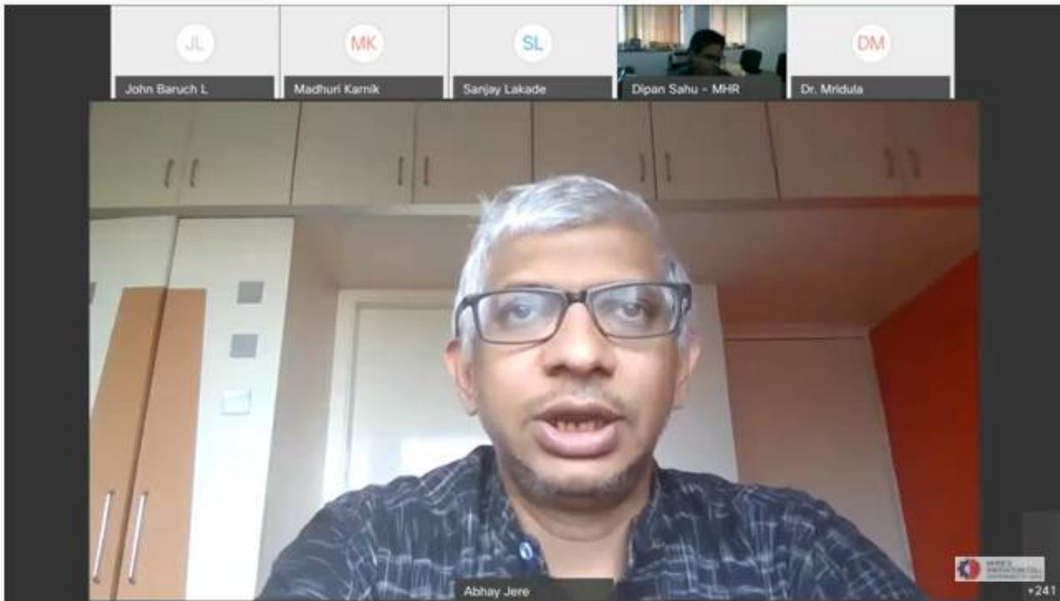
NISP Training Session 1: Orientation and Adoption of NISP at HEI Level